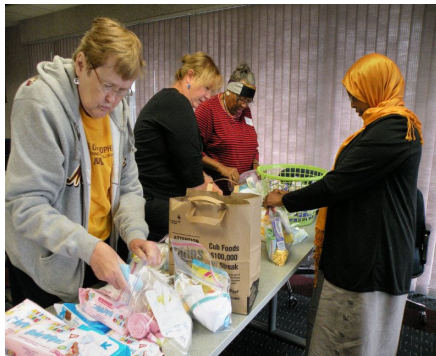
Zontians and Altrusans assembling the kits.