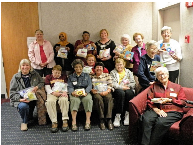
The entire group!

Meeting and social time 5:30 to 6:00 with dinner in one of the meeting rooms at Eagle Crest. The cost will be $20. We will need to make reservations for